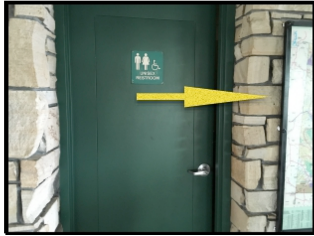
#7 - Add sign on latch side of door