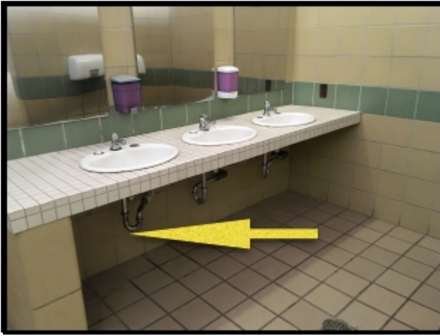
#6 - Wrap left drain pipe men's room