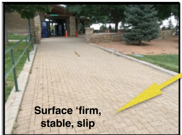
Surface 'firm, stable, slip