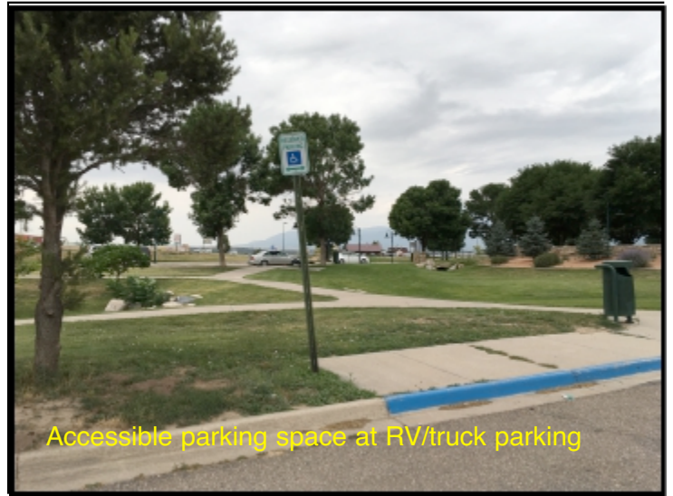
Accessible parking space at RV/truck parking