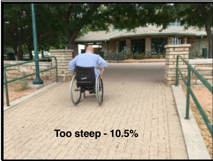
Too steep - 10.5%