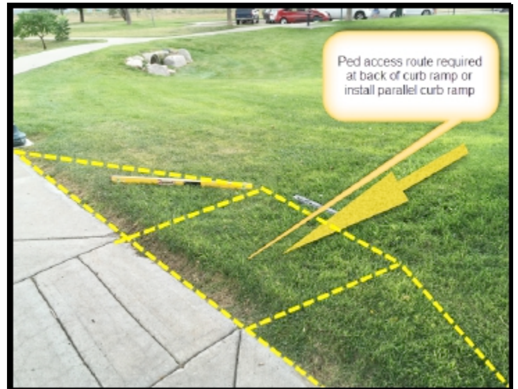
#9 - landing area needed