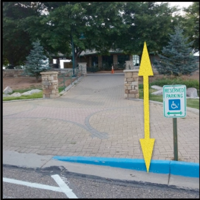
#1 - raise signs to 80"