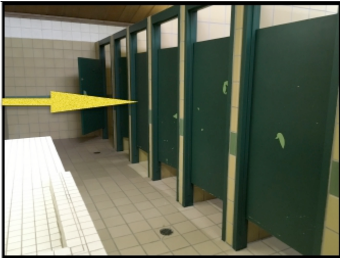
#8 - Create ambulatory stall