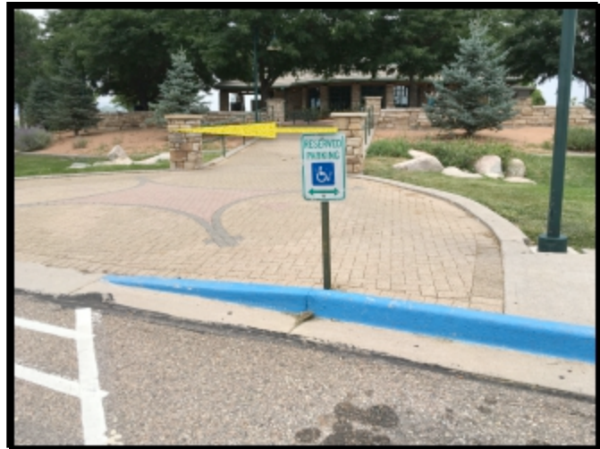
#2 - Install ISA symbol sign on stone pedestal with arrow to left