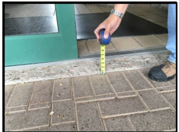
#5 - Grind threshold lip/ edge <math>< 1/2''</math>