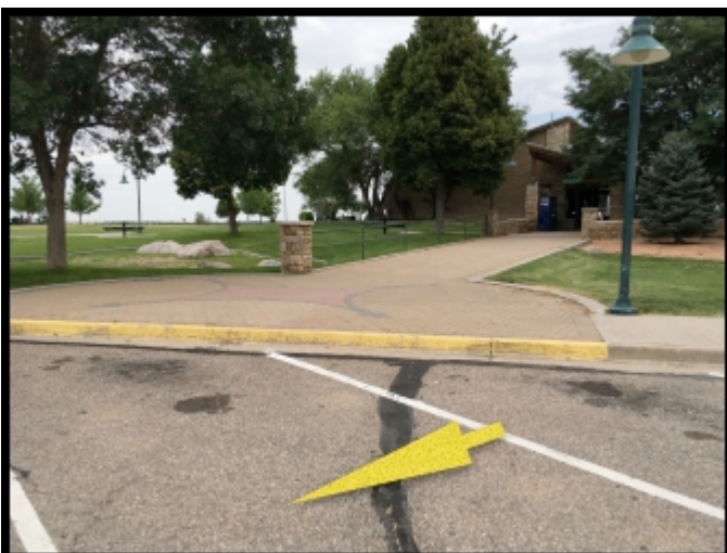
#3 & #4 - 2 new accessible spaces and curb cut